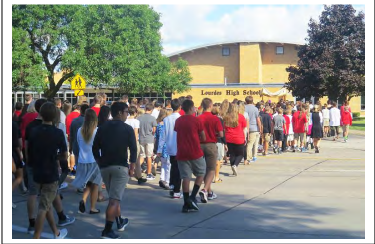
Lourdes Eucharistic Procession