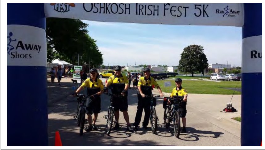
Oshkosh Irish Fest 5K