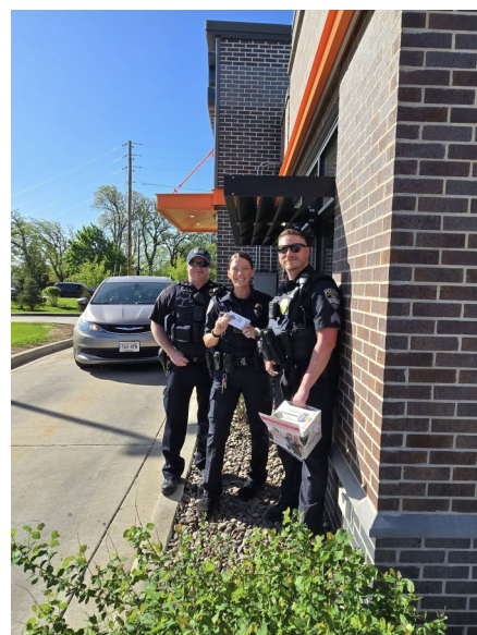
On May 16, Officers participated in the Dunkin Donuts fundraiser for Special Olympics "Cops on a Rooftop" event. Thanks to everyone who stopped by to support such a great cause!