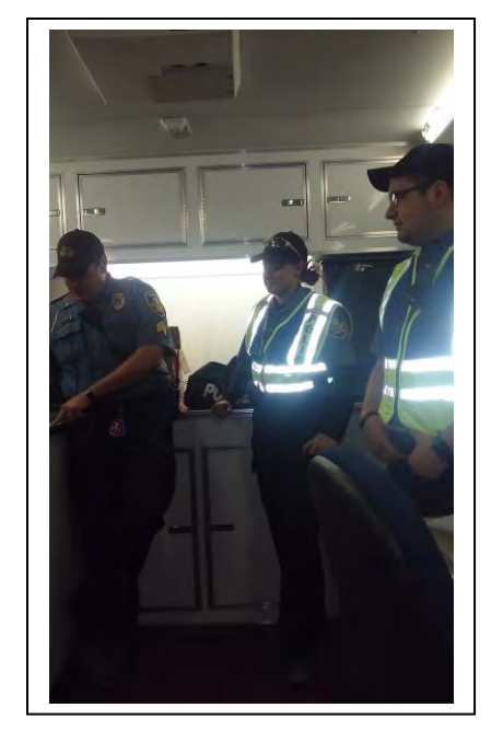
Country USA 2015