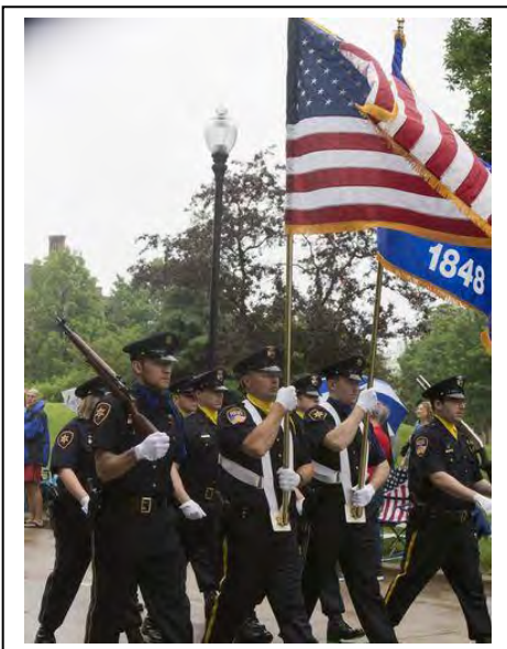
2015 Memorial Day Procession

You will be advised on which specific occasions you are allowed to wear the polo shirt. The Bike Team will continue to wear the polo as their standard uniform shirt while performing Bike Patrol activities. The balance of Unit members will only wear the polo when approved by senior ranking staff prior to the detail.